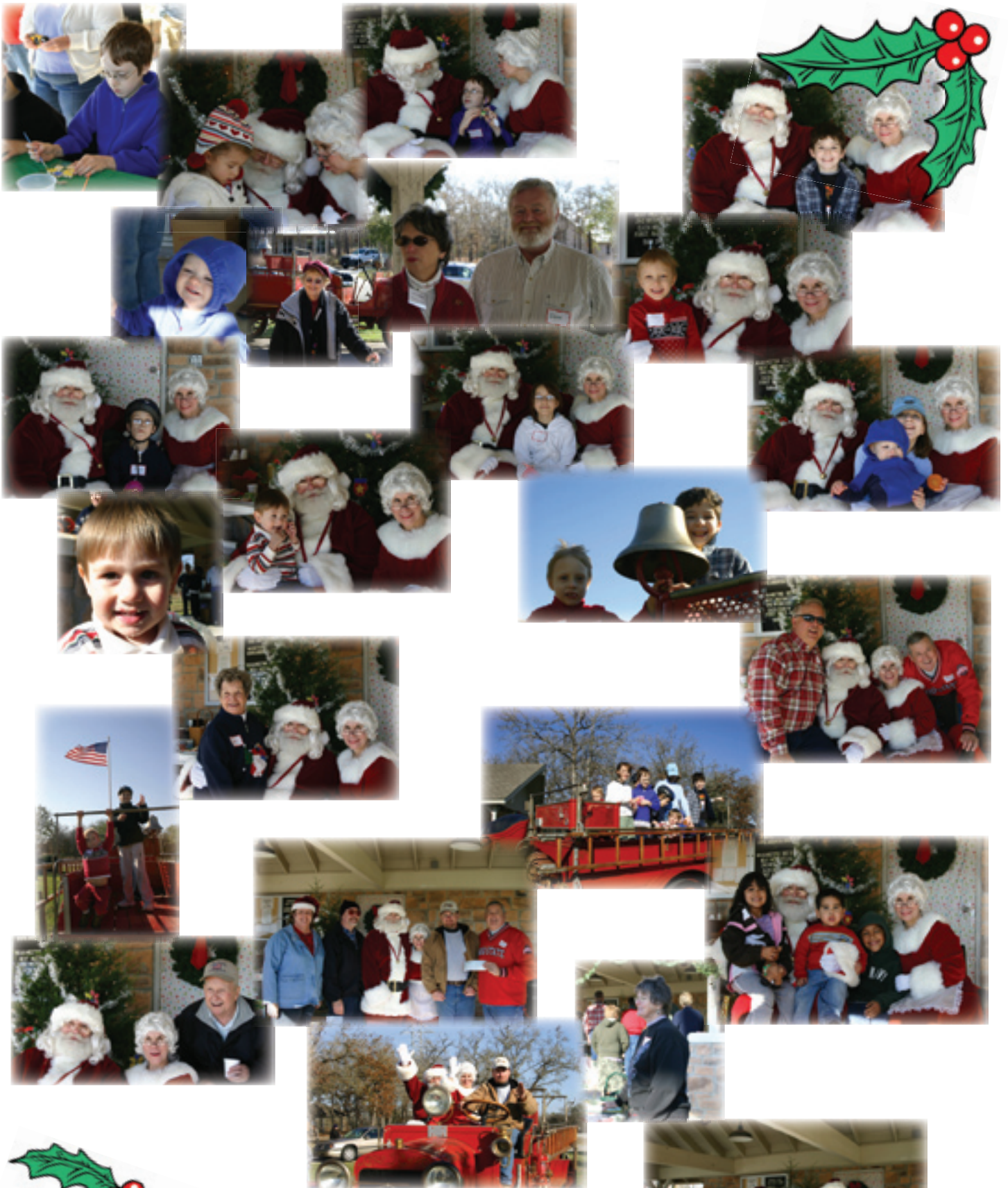
Santa in the Park December 15, 2007